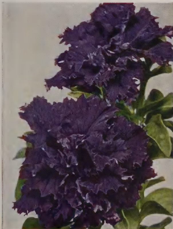
PETUNIA, BLUE BROCADE See description on page 24